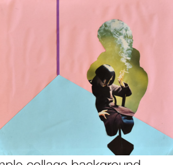
example of a stencil and simple collage background

Demonstrate building a background (landscape or architectural space) within which the figure is placed.