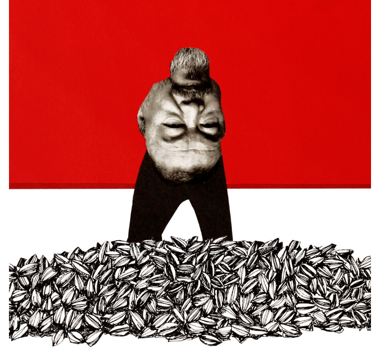
Seeds of Change (after Ai Weiwei), 2016, paper cut collage, 17.25 x 17.25 inches framed

Born in Edmonton and currently based in Vancouver, Canadian artist Tiko Kerr has earned high-profile recognition for his artfully liberated visual explorations of landscape and figurative scenes. His early body of work in his The Past Is Personal series explored the way that memory, emotion and personal narrative influenced his perception of his quotidian environment. In his recent collage work, Kerr investigates perception from a more conceptual angle that shifts into the surreal sublime. Investigating the spectrum of perception that exists between Pareidolia (perceiving an object where none exists) and Camouflage (where an existing object is made invisible), Kerr creates minimalist narrative spaces