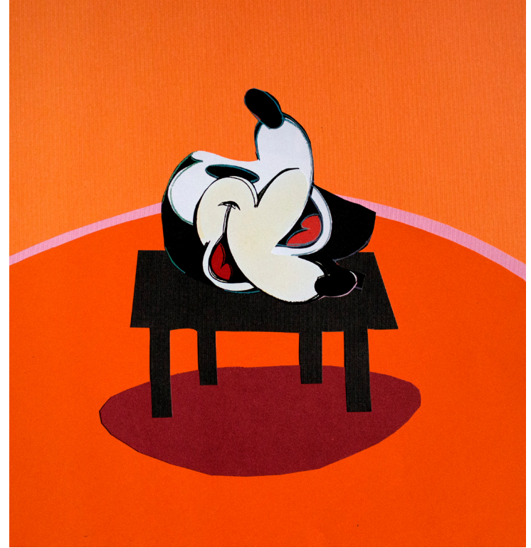
Walt Disney Contemplating Francis Bacon, 2016, paper cut collage, 17.25 x 17.25 inches framed